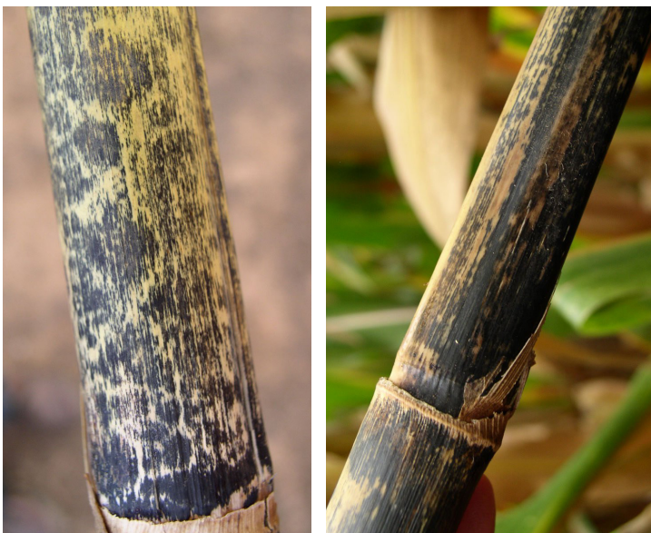
Figure 1. External stalk discoloration caused by anthracnose.