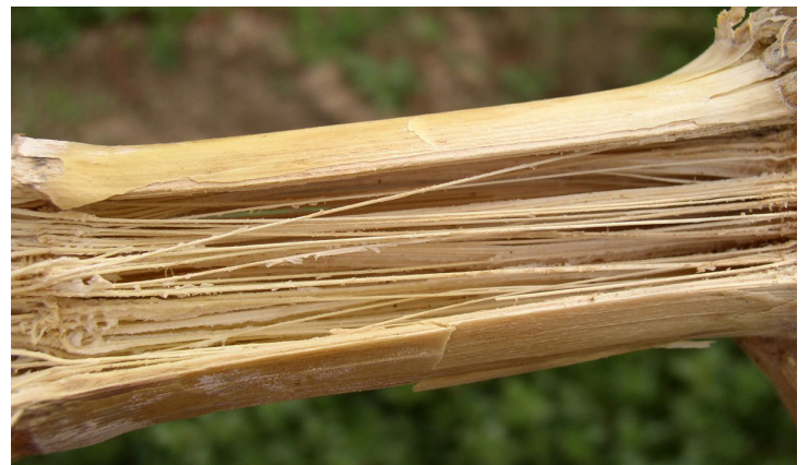
Figure 6. Disintegrated stalk pith caused by Fusarium.