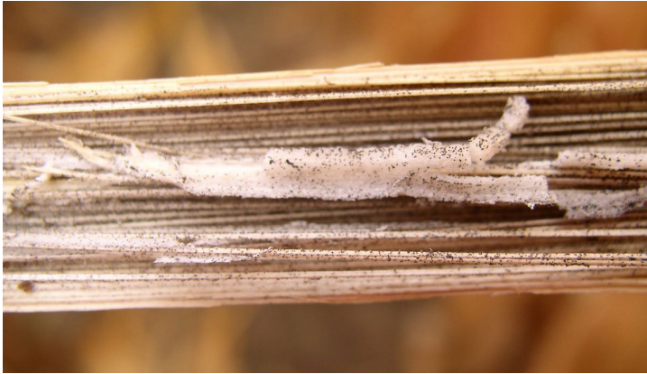
Figure 11. The very tiny black sclerotia on the vascular strands of the shredded pith are a characteristic sign of charcoal rot.