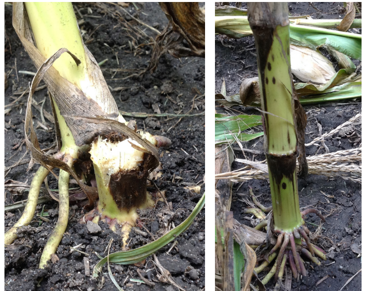
Figure 13. Stalk breakage and dark lesions on lower nodes of plants affected by Physoderma stalk rot.

The foregoing is provided for informational use only. Please contact your sales professional for information and suggestions specific to your operation. Product performance is variable and depends on many factors such as moisture and heat stress, soil type, management practices and environmental stress as well as disease and pest pressures. Individual results may vary. Corteva brand products are provided subject to the terms and conditions of purchase which are part of the labeling and purchase documents. CF180924 (210630)