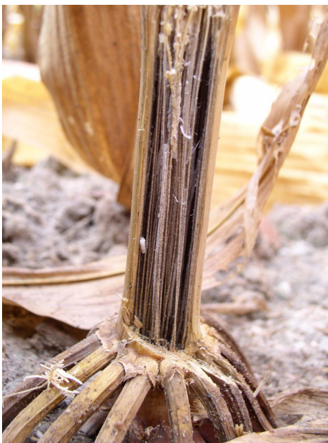
Figure 12. Charcoal rot begins as a root infection, which spreads into the lower stalk internodes and causes early ripening, shredding and breaking at the crown of the corn stalk. Charcoal rot is favored by heat and drought stress.